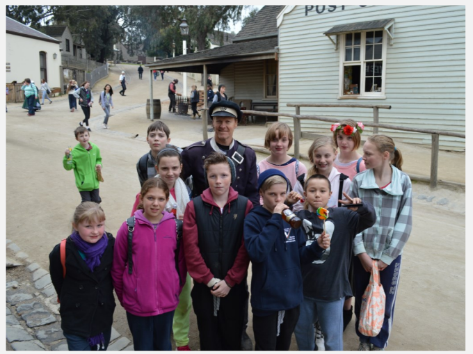
Kilmore Primary School Grades 5 & 6 Ballarat Camp 2014