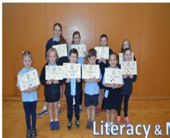
Literacy & Numeracy Awards