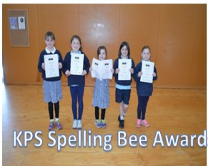
KPS Spelling Bee Awards