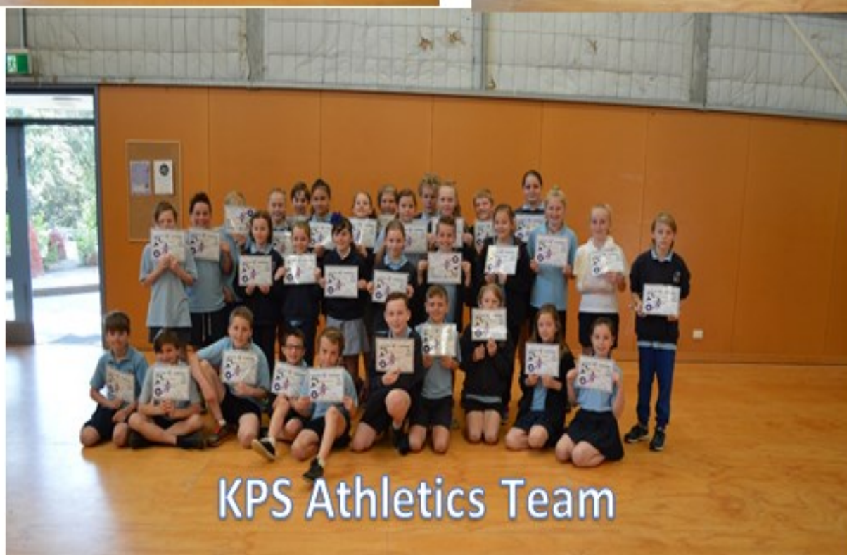
KPS Athletics Team