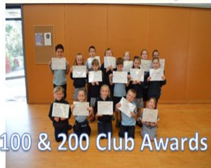
100 & 200 Club Awards