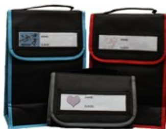
Insulated All Rounders

PLEASE NOTE: ORDERS WILL BE DELIVERED TO STUDENTS AT THE START OF TERM 1 - 2017