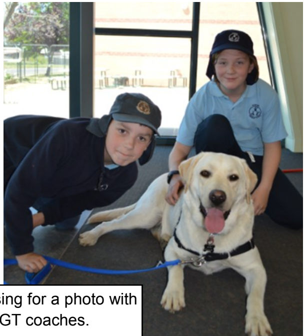
Pawsing for a photo with my KGT coaches.