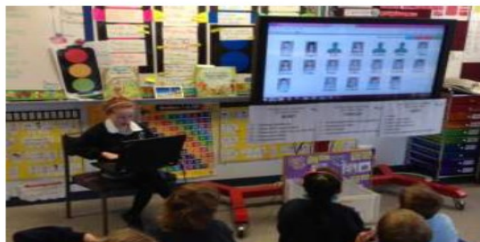
Marking the roll