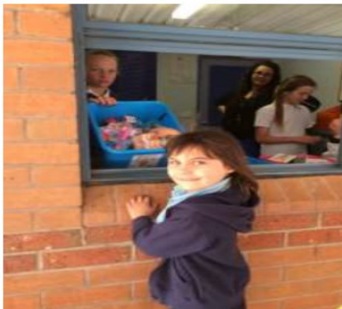
Lucky dip at the Beehive

We are very proud to say our students have been earning lots of 'bee tickets' for demonstrating the school values of being Kind, Proud and Safe. They can trade them in for some great prizes at the Bee Hive, but there are also a lot of other rewards students may choose such as sitting in a comfy chair, helping in another classroom, hot chips, marking the role or class parties.