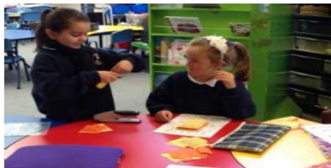
Helping in another classroom