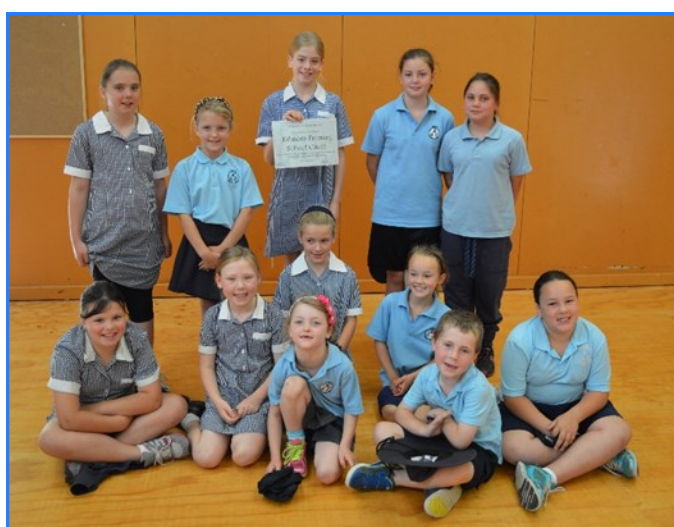
Kilmore Primary School Choir Certificate of Appreciation from Dianella Nursing home