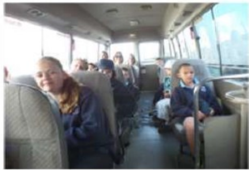
Sitting on the bus quietly with seatbelts on

We are all very excited to have school excursions coming up next week, but we also want to remind students of the high expectations we have for their behaviour when they are outside school. We were very impressed with how Kind, Proud and Safe the students were on excursion to the Royal Botanical Gardens last week. Here are some of the wonderful things they were doing: