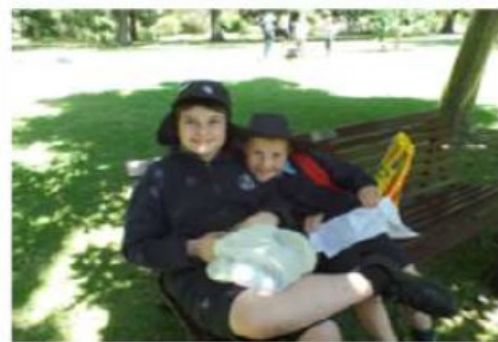
Being kind and helping each other

Thank you for being Kind, Proud and Safe KPS students! From the SWPBS team.