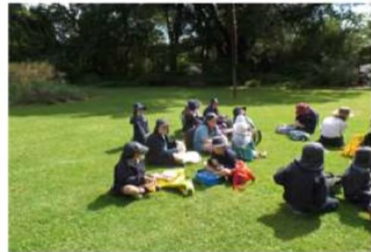
Sitting together to eat, taking all rubbish with them, because there were no bins