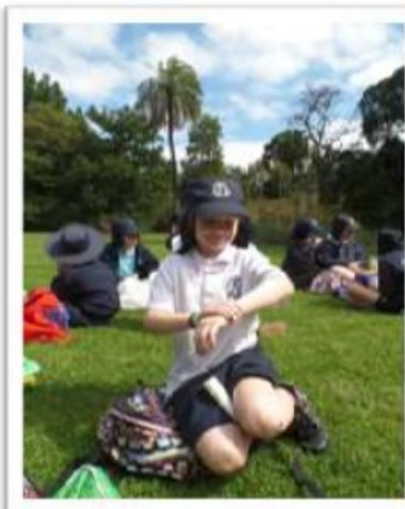
Wearing hats and applying sunscreen for safety outdoors