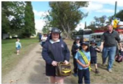
Walking together with a partner to the venue