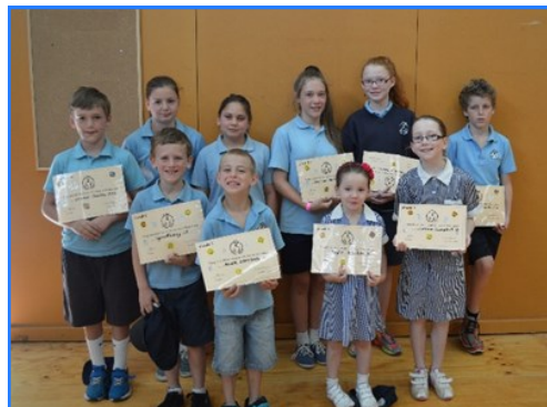
Numeracy Award Winners