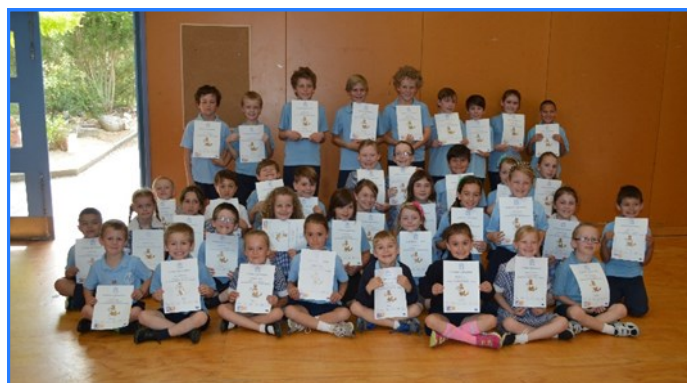
Premiers Reading Challenge Awards