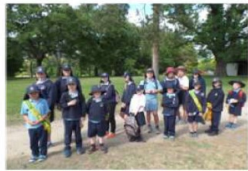
Lining up sensibly