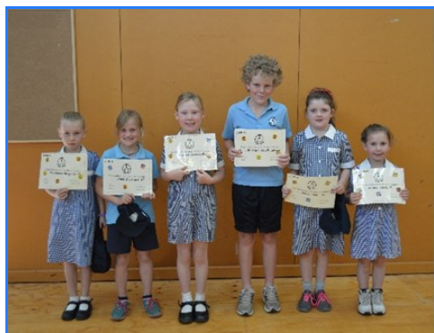
Literacy Award Winners