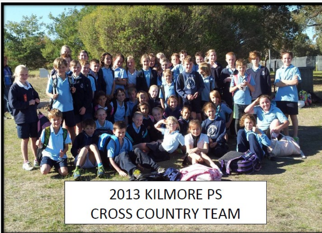
2013 KILMORE PS CROSS COUNTRY TEAM