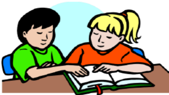
The Literacy Team

And...senior students will be asking teachers what their favourite childhood book was. Stay tuned to find out about your teachers favoured story that he/she loved to read as a child.☺