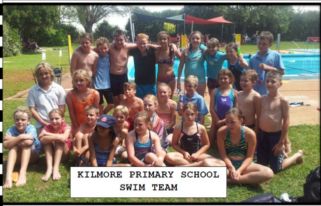
KILMORE PRIMARY SCHOOL SWIM TEAM